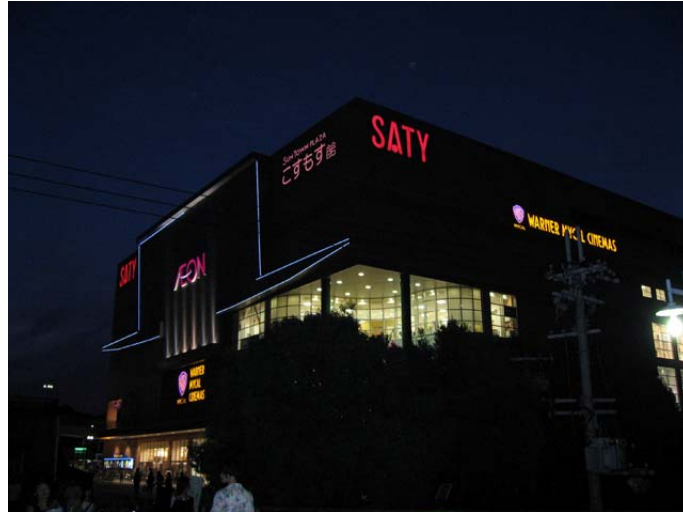
PICTURE 1 - AEON mall near our residence

Even at the suburban area, the population density is much greater than in Vancouver. Supermarkets, banks, train/bus stations are all within walking distance which is very convenient. Fortunately, right beside our residence, there is a newly built mall called AEON. It was just opened a month before I arrived there. I guess that was the time I began to realize an interesting fact, the “old” and the “new” lies side by side.