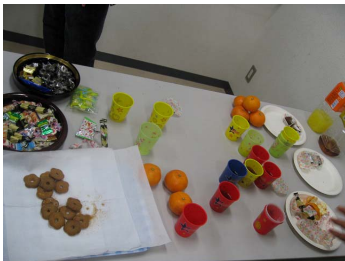
PICTURE 3 - The food and drink during Tea Break

During the break, we would sing a song together with everyone in the class then have some cookies and tea. I guess that was the only time I could meet a lot of foreigners and use English as freely as I can.